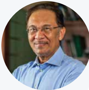
YB Dato' Seri Anwar Ibrahim Member of Parliament, Port Dickson President of the People's Justice Party (PKR)

7 billion dreams ONE PLANET communicate WITH A CAUSE