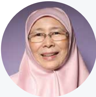
YAB Dato' Seri Dr Wan Azizah Wan Ismail Deputy Prime Minister of Malaysia