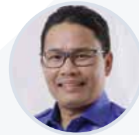
Senator Khairul Azwan Harun Member of Dewan Negara